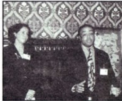
On the national stage - Jane Griffiths chairs a meeting in the House of Commons with Government minister Paul Boateng MP