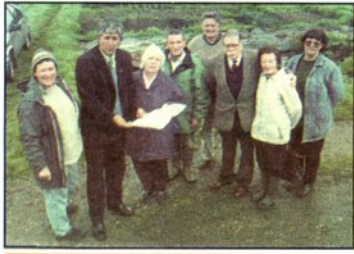
Winning for Reading - Martin Salter with local people successfully campaigned to save the privately owned Tilehurst allotments from the developers.

Sanctuary Tenants - Fords Farm, Dee Park Residents Association, Central Whitley Community Association, South Whitley Community Association, Coley Park Community Association, Armour Road Residents' Association, Southcote Residents' Association, Age Concern - Theale Carers Group, Neighbourhood Watch.