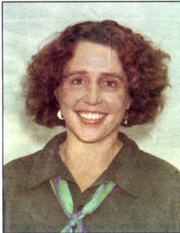
Jane Griffiths MP - Reading East