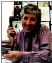
Another busy day at the office

Local people are turning up to my regular MP advice surgeries in their hundreds, with issues and individual problems. This on top of a large mailbox means that I have now dealt with over 2,500 cases. Sometimes these issues are local and I write on constituents' behalf to organisations such as local councils and health authorities. I also