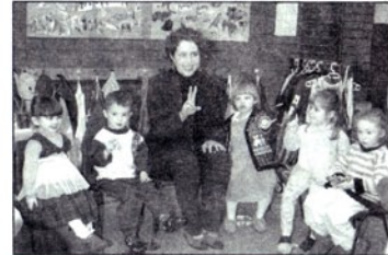
More money for education. From early years education for all four year olds to money to reduce class sizes and improve standards for all.

pensioners and almost £117 for pensioner couples. Around 6,000 of the least well-off pensioners in Reading will gain, nearly £5 a week extra for single pensioners and over £7 for couples.