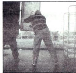
Beer smuggling is a growing problem in Reading

Europe. It is also very difficult for local residents to take action against pubs and clubs which cause a nuisance. I am looking to make changes to make going out more civilised and safe and end the English lager lout culture.