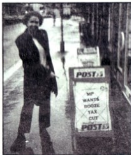
Jane Griffiths MP joined MPs from all parties to see Treasury Minister, Barbara Roche MP before the budget to seek to prevent an increase in alcohol taxes. They didn't go up.

The Parliamentary Beer Club is a Group of MPs from all political parties which works with brewers, publicans and others from the licensing trade. I am Vice Chairman of the Club.