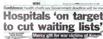
Reading Evening Post headline 31st March 1999 - shows how waiting lists are falling.

More good news for our local health services. The government has provided £73 million to build a new hospital on the Royal Berks site and work has already started. Now it has been announced that they are on target to reduce waiting lists as promised before the election. The improvement has been due to hard work by the doctors and nurses and extra money from the government.